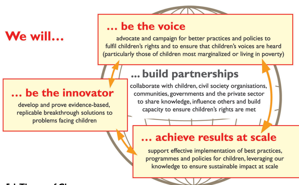
Figure 5.1 Theory of Change

The Families First programme in Indonesia demonstrates key strategic elements of government care system reform, moving from institutional to family-based care, with support from Save the Children. The reform was initiated after Save the