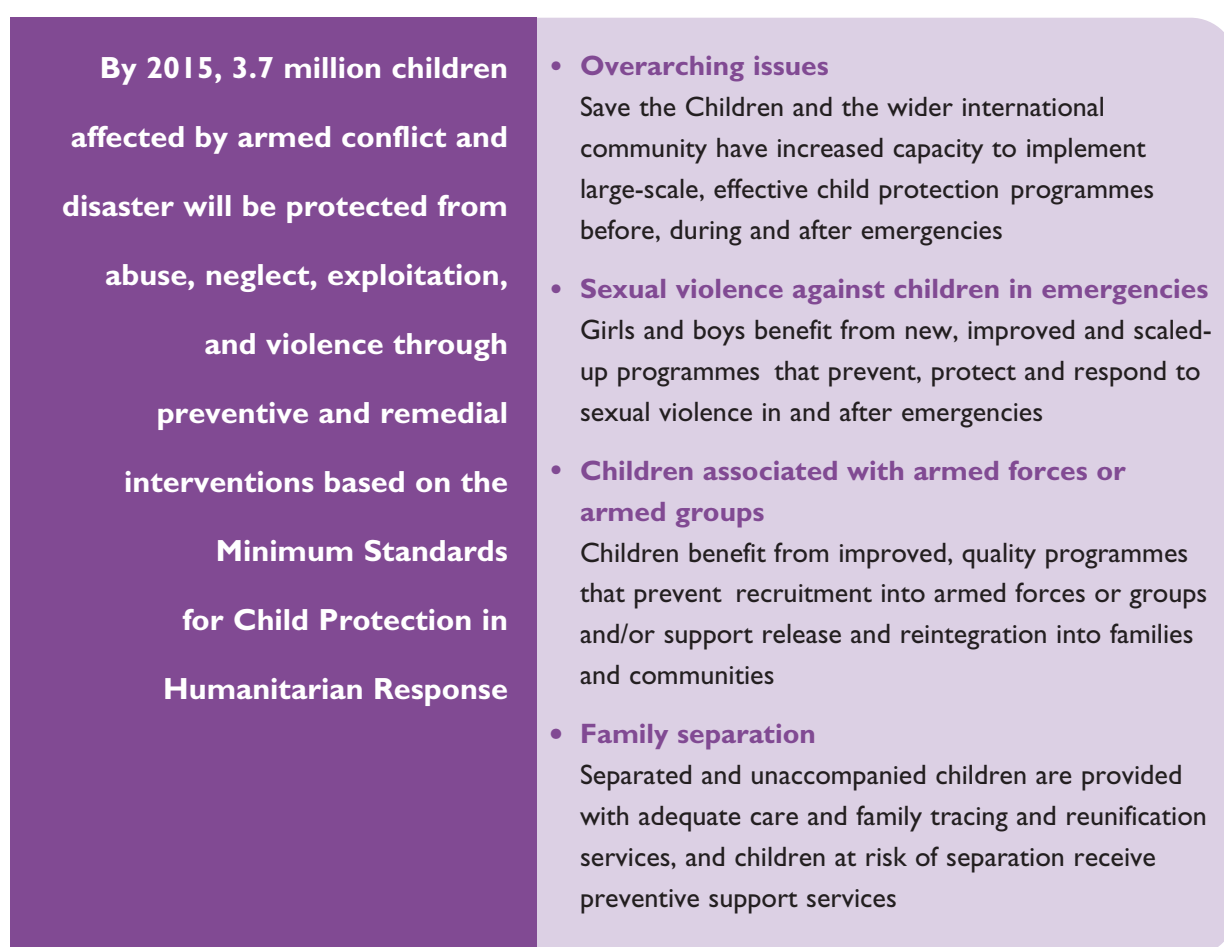
Figure 3.2 Child Protection in Emergencies: goal and sub-themes for the period 2010-2015 39

Children are extremely vulnerable during a humanitarian crisis. They are at risk of recruitment into armed forces and groups, sexual violence, separation from their families, psychosocial distress, trafficking and economic exploitation, genocide, physical violence, killing and maiming, and other forms of harm. Family separation and the breakdown of national and community-based child protection systems make girls and boys especially