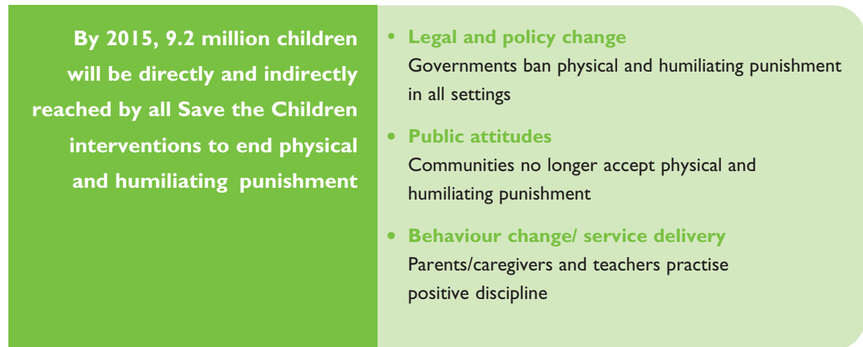
Figure 3.3 Physical and Humiliating Punishment: goal and sub-themes for the period 2010-2015 44

“With these two hands my mother holds me, this I love. But with these two hands my mother hits me. This I hate.” Girl, East Asia and the Pacific 43